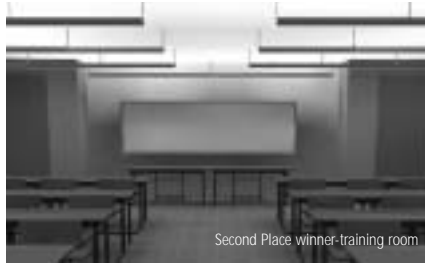
Second Place winner-training room