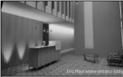
First Place winner-entrance lobby

For the sixth year, The Philadelphia Section of the Illuminating Engineering Society, sponsored Design with Light, an annual student lighting design competition. The 2004-2005 competition was co-sponsored with Kling. The project was Dental Complex, Pennsylvania. The scope of work included the lighting of the vestibule, 2-story entrance lobby, corridor, conference rooms, open office, training rooms, lunch room, computer room, exterior entrance area, building façade and walkways adjacent to building on site.