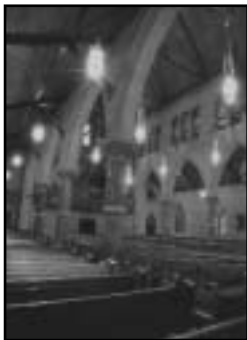
2001 IIDA winner- First Presbyterian Church; Designers: Kristen Keilt & Annette Hladio

■ Support for education including: ○ Nationally accredited lighting courses with CEU (continued education units)- ED100 - Lighting Fundamentals typically offered in the Fall and ED150-Intermediate Lighting offered in the Spring ○ Materials and curriculum