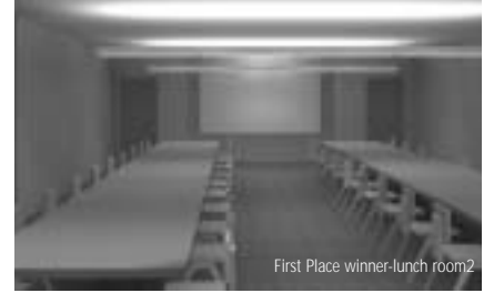
First Place winner-lunch room2

The IES Philadelphia section thanks our past Design With Light co-sponsors: